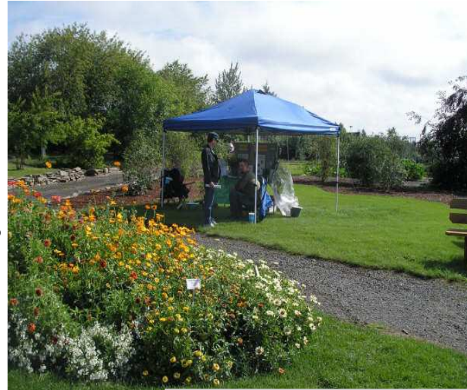
Invasive Weed information booth at Georgeson Botanical Garden in 2008