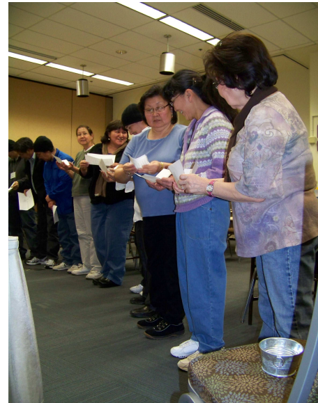
Workshop participants demonstrating that everything flows downstream.