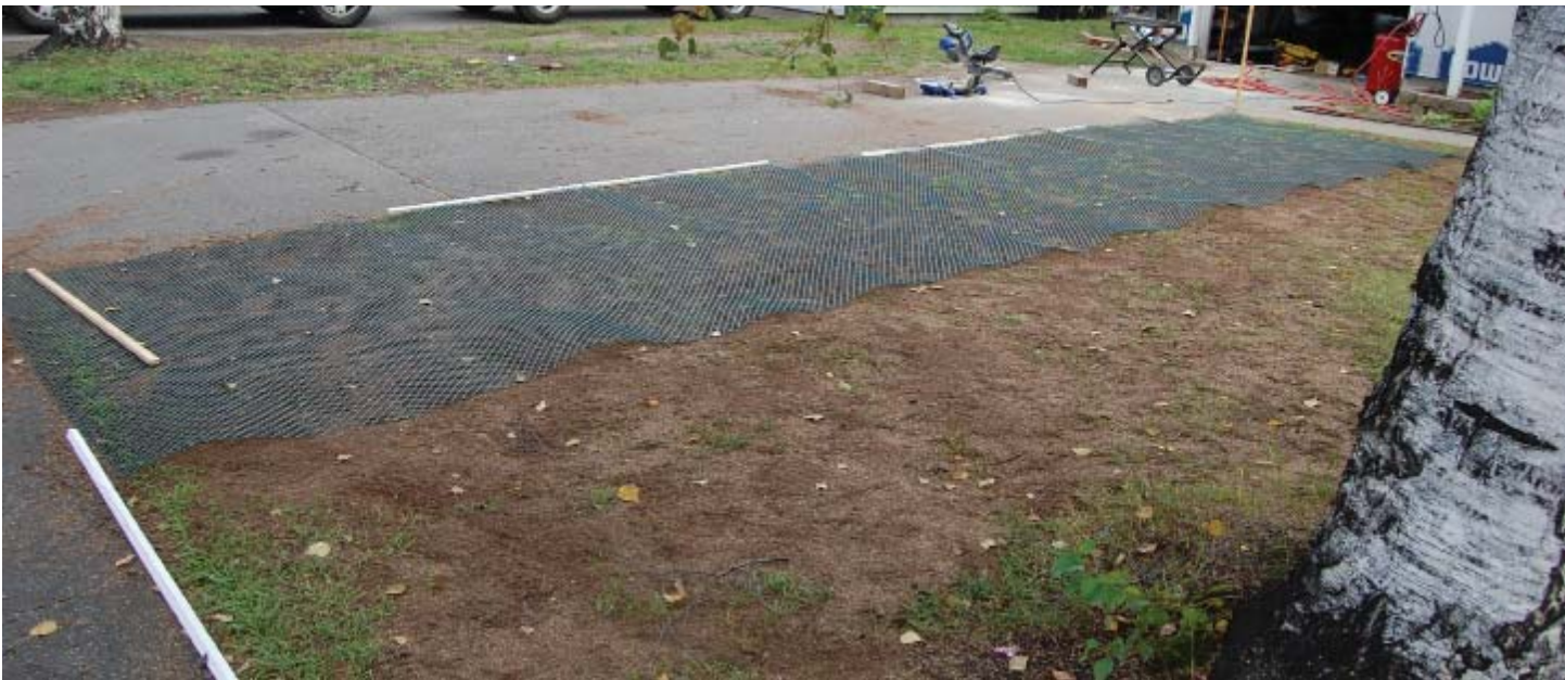
Ground leveled, with mesh layed out prior to pinning.