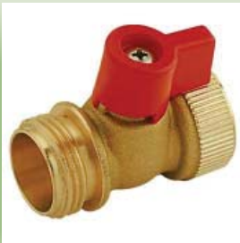
Garden Hose Valve