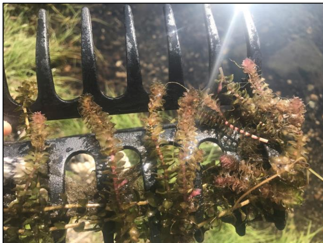
Elodea in the slough is displaying signs of damage (pink tips)

Five drinking water wells were selected at random from 154 residences with wells within 200 ft of the slough. Well samples were tested for fluridone prior to treatment, and 2 times post-treatment in July and August. No fluridone was detected in wells.