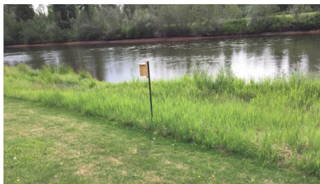
An enhanced riparian zone that has been planted with native species (above).

This Streambank Riparian Buffer Zone program is intended to help mitigate further degradation of the Chena River and associated sloughs through education, outreach, and restoration along the Chena corridor through the Fairbanks and North Pole areas. This program is an extension of the former Salmon and Soil program that provided soil testing and fertilizer recommendations for private landowners that border the Chena and associated sloughs. The program will continue to provide soil testing and fertilizer recommendations, along with a workshop and demonstration. The workshop and demonstration will show attendees some buffer zone revegetation techniques that