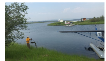
FSWCD staff survey the Fairbanks Airport float pond for Elodea

FSWCD and the Fairbanks Elodea Steering Committee will continue to communicate with landowners along Chena Slough as on-the-ground treatment plans unfold this summer.