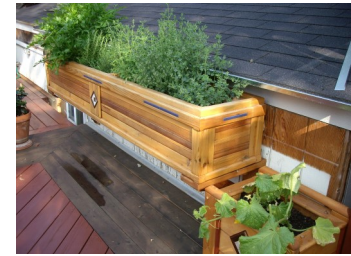
This flow-through planter is a beautiful example of a Green Infrastructure practice

guide and more information about Green Infrastructure are located on our website: www.fairbankssoilwater.org/resources-green-infrastructure.htm