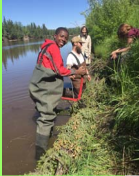
FYH crew working on a streambank restoration.

FSWCD's work with youth in the community continues as we enter the summer 2018 season. The program, funded by the US Fish and Wildlife Service, hires youth ages 13-14 from Fairbanks to work on conservation projects that benefit the community and to learn about natural resources. Crew members work alongside local professionals, while learning life skills and gaining new experience. Students who are hired this